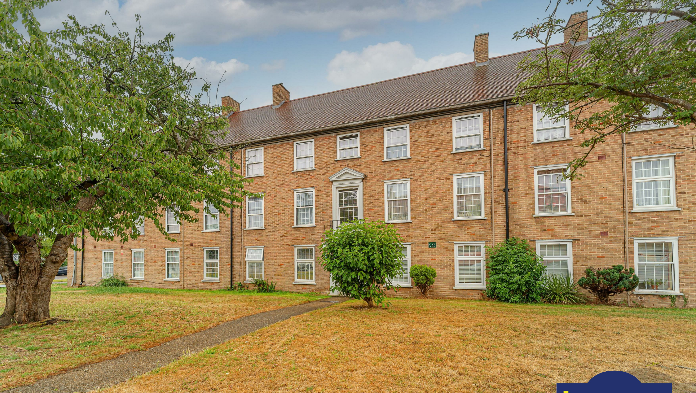
Manor Court, EN1 4SN Enfield